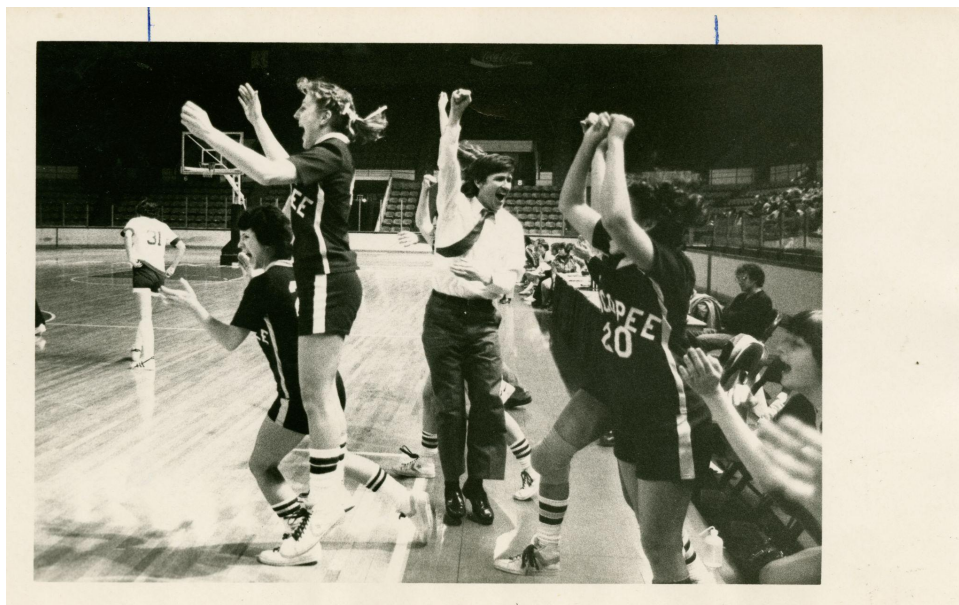
1981 Pacers team celebrates victory over Holyoke in Division I Western Massachusetts Girls Basketball Tournament